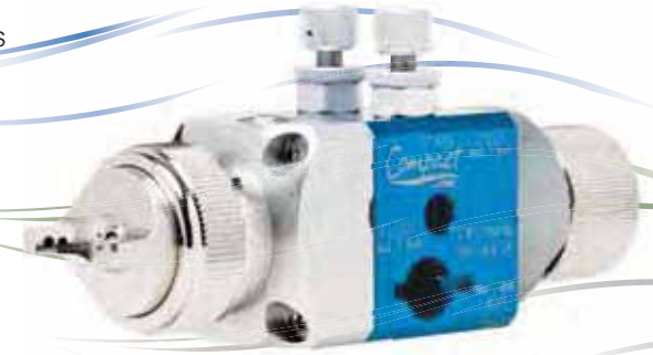
Compact Automatic I

Available in Trans-Tech, HVLP and Advanced Conventional