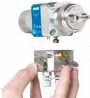
Compact Automatic X

All the features of the Compact Automatic "I" plus fast & easy removal from the mounting block.